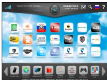
System of payments SKYSEND