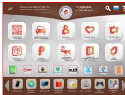
Government Services of Russian Federation