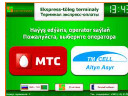
System of payments SAZ HYZMAT