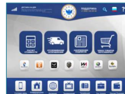
National Russian Post