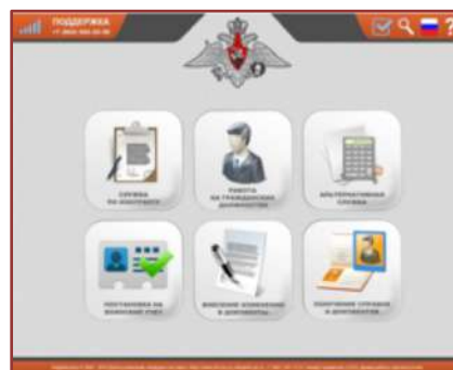
Military commissariats of Russian Federation