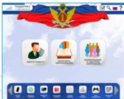
Penitentiary Service of Russian Federation